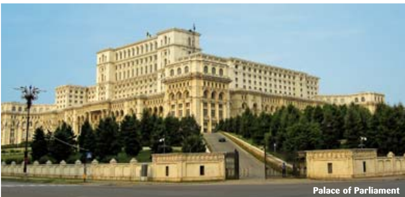
Palace of Parliament