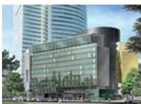
(2) Radisson SAS Centrum ★★★★★

Grzybowska 24 Centrally located modern hotel. 311 rooms in Maritime, Scandinavian and Italian styles, comfortable and well equipped including an espresso machine. Free broadband and wireless internet access. Restaurants, bar, gym and pool.