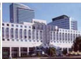
(3) Holiday Inn ★★★★

UL. Zlota 48/54 Large modern hotel in the heart of the city, close to historical sites as well as business centre. Rooms with Sat-TV, phone, minibar. Restaurant, gym, parking.