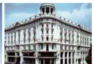
(5) Royal Meridien Bristol ★★★★★

UL. Krakowskie Przedmiescie 42/44 Elegant hotel in the old town. Rooms furnished in traditional style with modern amenities. Restaurant, pool, sauna. We use superior rooms.