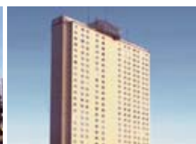
(4) Novotel Centrum ★★★

24/26 Nowogrodzka St. Warsaw's major tourist hotel has all visitor services. Popular hotel located near the main station, tram at door. 731 spacious rooms with A/C, TV, phone, minibar, safe, hairdryer. Restaurants, bars, nightclub, fitness centre.