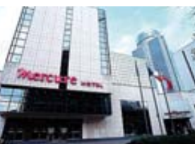
(1) Mercure Fryderyk Chopin ★★★

AL. Jana Pawla II Str. 22 Large, modern hotel in the city centre, a short walk from the old town and close to commercial and business districts. 242 well-equipped rooms with room service, A/C, Sat-TV, internet, minibar, hairdryer. Restaurants, bar, café, fitness centre.