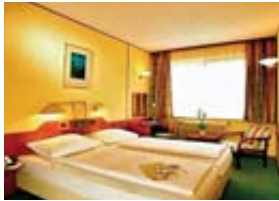
(2) Alpha ★★★