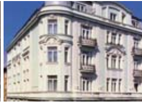
(4) Johann Strauss ★★★★★