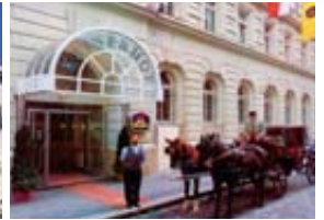
(5) Kaiserhof ★★★★★