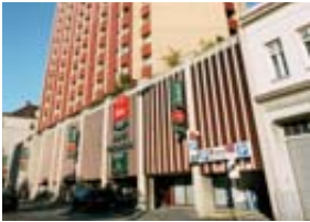
(1) Ibis ★★★