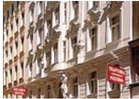
(3) Graben ★★★