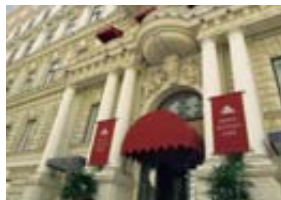
(8) Rathauspark ★★★★★