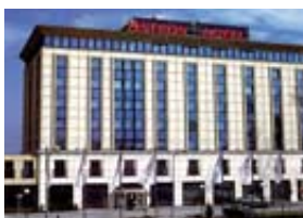
(12) NH Vienna Airport ★★★