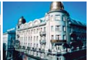
(10) Astoria ★★★★★