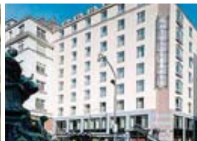
(9) Europa ★★★★★