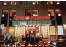
(6) Mercure Zentrum ★★★★★