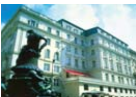
(11) Ambassador ★★★★★