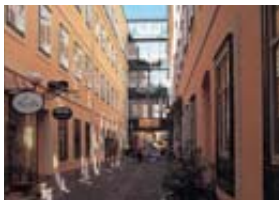
(7) Mercure Grand Biedermeier ★★★★★