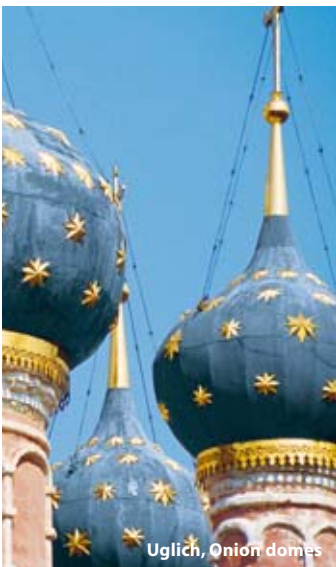
Uglich, Onion domes

Founded in 1703 by Peter the Great as his "Window to the West" St Petersburg is the most European of Russian cities and one of Europe's loveliest. Laid out in perfect symmetry with boulevards radiating from the centre, the city contains a unique balance of Russian and Western European architecture. Spread across 101 islands with 66 canals and 365 bridges, it is a magnificent maritime city rivalling Venice. Your city tour includes Nevsky Prospekt, the Summer Gardens and Palace Square, Peter & Paul Fortress and a highlight for art lovers – the Hermitage Museum.