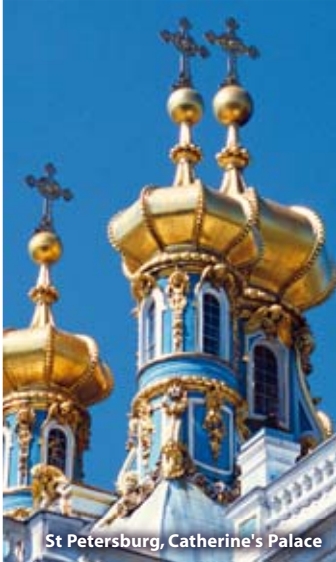
St Petersburg, Catherine's Palace