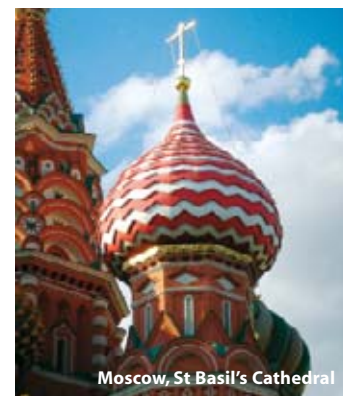
Moscow, St Basil's Cathedral

After breakfast your tour services end with a transfer to the airport. B