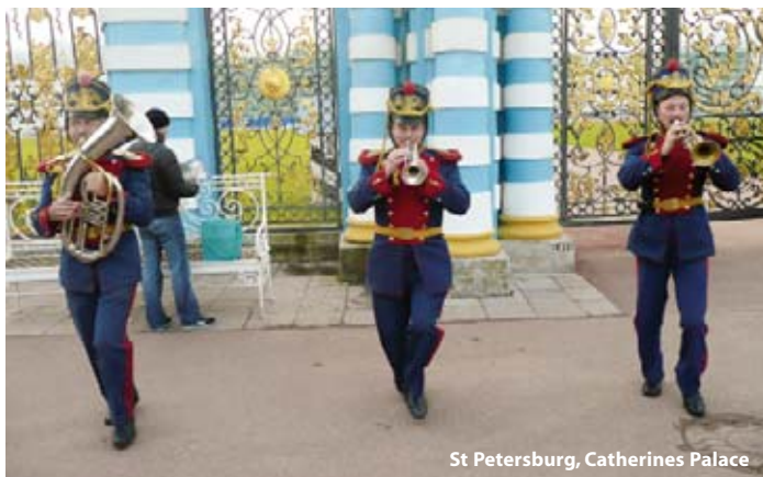
St Petersburg, Catherines Palace