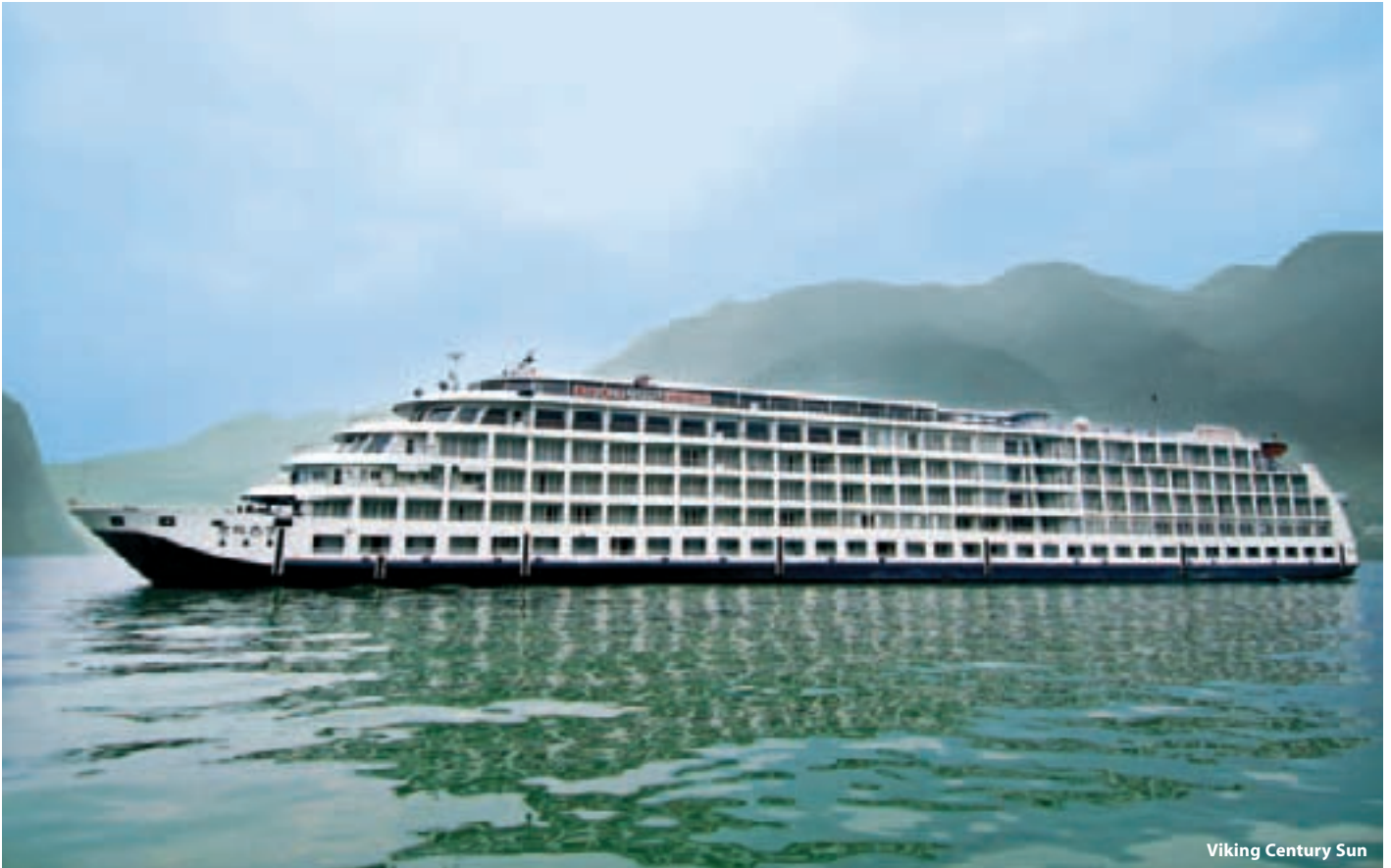
Viking Century Sun

This ship has been awarded a 5-star rating by the China National Tourism Office.