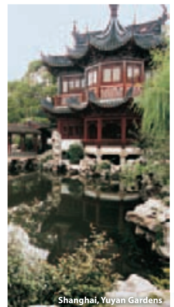
Shanghai, Yuyan Gardens

Your tour ends after breakfast when you check-out of your hotel.